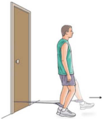
Knee stabilization: C