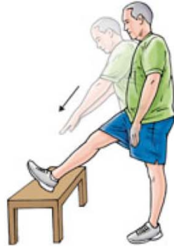
Standing hamstring stretch