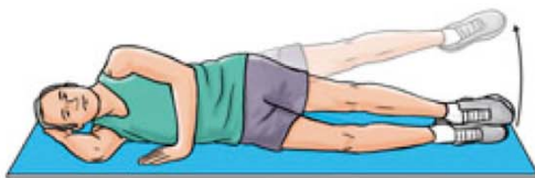
Side-lying leg lift