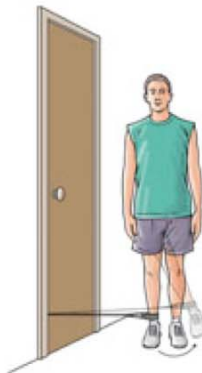
Knee stabilization: D