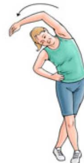
Iliotibial band stretch (side-bending)