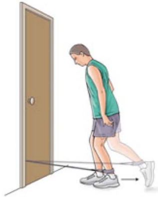
Knee stabilization: A