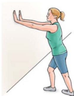
Standing calf stretch