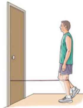
Resisted terminal knee extension