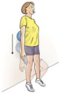
Wall squat with a ball